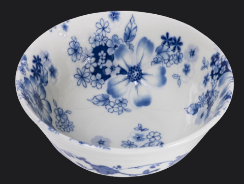
Hana Tsudoi Bowl 15.2 x 6.7cm / MB15323HT