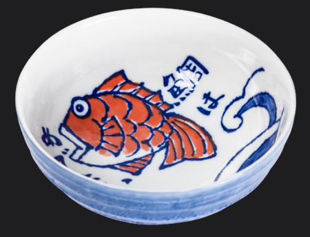
Plate 24.5 x 3.9cm / MP2480TA