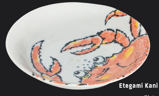
Plate 20.6 × 4.5cm / MP2080KA